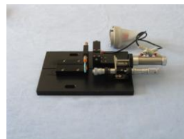
Micro Pneumatic Precision Actuator for Tipping Small Diameter Tubes