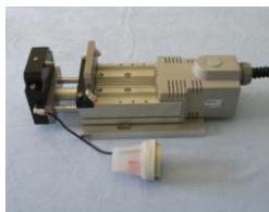
Programmable Electric Slide Actuator for Tipping and Flaring