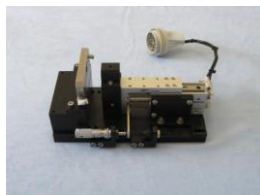
Standard Precision Pneumatic Actuator for Tipping and Flaring