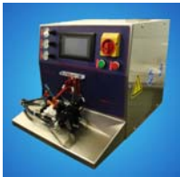
Slope Front Platform

Incorporated into this machine is a split collet carriage. This along with a precision regulator / valve feed system provides each catheter tube an independent travel and depth control as well as reacting individually to the “melt” of the tube during processing. Available as front feed or standard side feed.