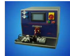
Tipping / Induction Eye-Forming

Produce Tips and smooth polished eyes in one cycle of the machine.