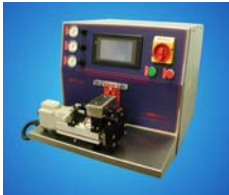
Tipping / Skiving

This machine produces completed tip-formed catheters with cut eyes per cycle. If the catheter design requires a drilled eye, a drilling unit replaces the eye-cutting device. Magazine loading and part ejection is available.