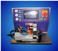
Tipping / Punching

Produce Open or Closed Tips and Skive eyes in one cycle of the machine.