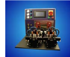
Dual Alternating Machine

We have provided equipment for processing tubing from 1fr to 40fr and many other unusual custom applications.