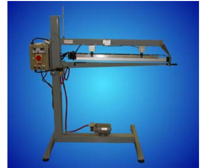
Thermal Impulse Sealer: for sealing thin plastic film sleeves.

PlasticWeld Systems, Inc. 3600 Coomer Road Newfane, NY 14108 USA P#716-778-7691 F#716-778-5671 email: pwsinc@localnet.com Web-Site: www.plasticweldsystems.com