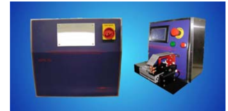
Remote Power Supply for Tipping, Welding, Bonding, Upsetting.....

This heat station is ideal for instances where it is desirable to remove the power supply from the clean room environment or bench top space is limited. This unit is designed for tipping, welding, bonding and upsetting.