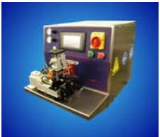
Tipping / Drilling

Produce Open or Closed Tips and Punch eyes in one cycle of the machine.